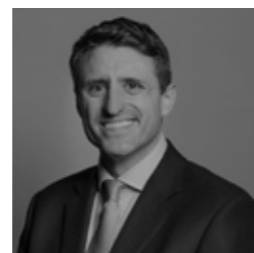
Ben Everitt MP