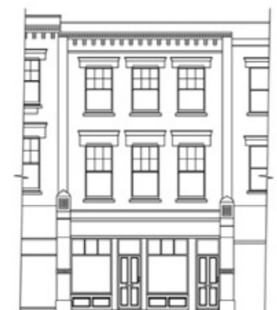
Alternate elevation with central door